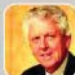
Lord Powell of Bayswater KCMG, President, China-Britain Business Council

Hong Kong is the ideal entry point to the thriving markets of the Pearl River Delta in the same way as the UK is the ideal gateway to Europe. Hong Kong's rule of law, respect for human rights, free flow of information and people, and sophisticated services sector create a familiar operating environment for UK investors.