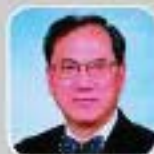
The Hon. Donald Tsang, Chief Secretary for Administration of the Hong Kong SAR

We earnestly invite you to cooperate with us to build the Greater Pearl River Delta (GPRD) into one of the world's most dynamic economic centres and to create our mutual prosperities through partnership in Europe, Guangdong and Hong Kong.