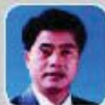
The Hon. Huang Huahua, Governor, Guangdong Province, P.R.China

We earnestly invite you to cooperate with us to build the Greater Pearl River Delta (GPRD) into one of the world's most dynamic economic centres and to create our mutual prosperities through partnership in Europe, Guangdong and Hong Kong.