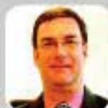
Chris Wood, British Consul- General to Guangzhou

By having operations in both Hong Kong and the Mainland, enterprises of any sector, size or function can enjoy the "best of both worlds". Hong Kong is well-placed to serve as the world class business centre, trading entrepot and transport, logistics and services hub to complement the production powerhouse of our neighbours in the Mainland.